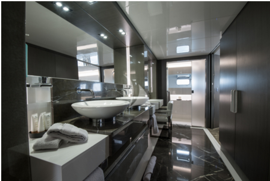
En-suite Master Cabin