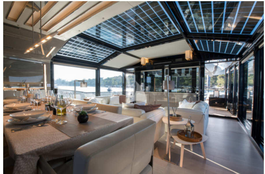
Dining table & Salon