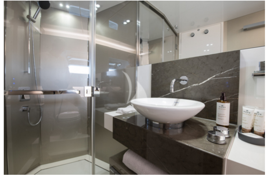
En-suite Double Cabin