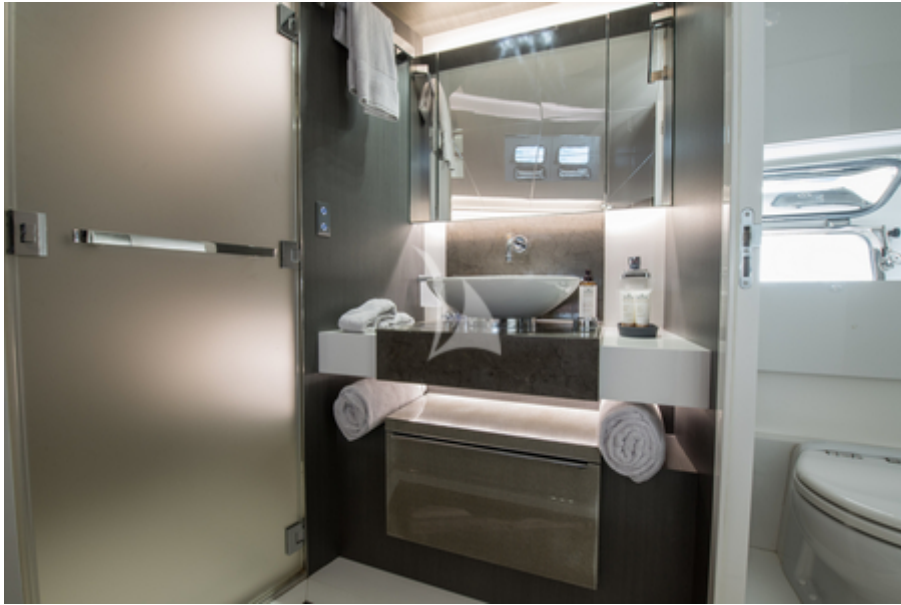
En-suite VIP Cabin